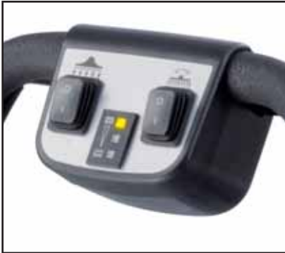
Self explaining control panel