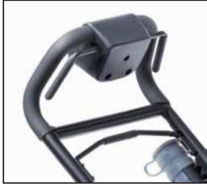
Quick-Stopp as standard